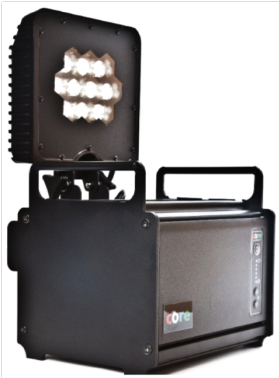
Compact size with tilting/closing head