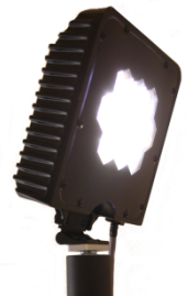
Removable Head. Attach to tripod or accessory

*Settings up to 80% of max brightness with larger battery