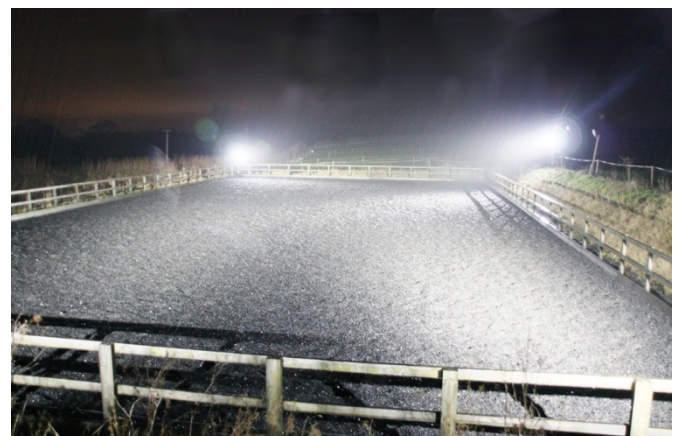
2 or 4 Units to light 45 x 25m arena – during rainfall