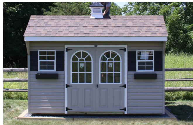
Floor Skid Placement