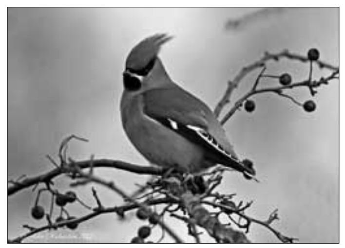
Bombycilla garrulus aka the waxwing. Black and white does not do justice to this beautiful bird - but its distinctive crest makes it easy to identify, along with its black eye 'flash' and yellow feathers along the edge of its wing.

Suddenly, bird noise breaks into my musings and I stop by a stand of five gnarled Bramley apple trees, pruned to resemble knobbly umbrellas. I expect to see the stragglers of a visiting flock of fieldfares and redwings that enjoy feasting on the unpicked and fallen apples for a few weeks in the winter. Instead, to my delight, perched on the branches is a flock of thirty or forty of those celebrity birds with their buff and pink plumage and the distinctive crest pointing skywards. Waxwings! My own private viewing and not a twitcher in sight.