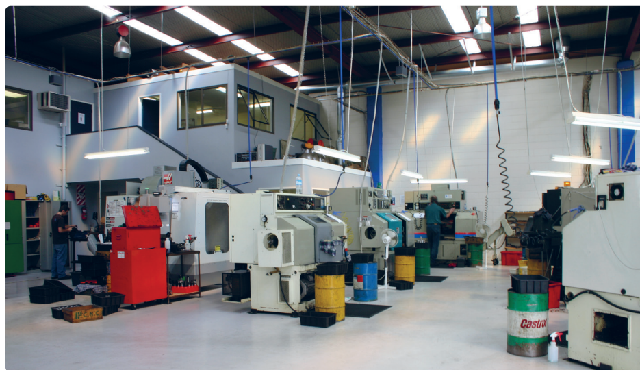
^ CNC Machining operates 14 CNC machines at its manufacturing facility in East Tamaki

CNC Machining Co has developed its own production planning system in house and controls every aspect of its customers' requirements.