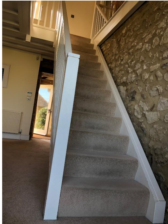
Stairs to first floor