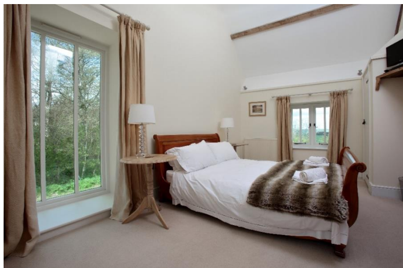
Master Ensuite Bedroom