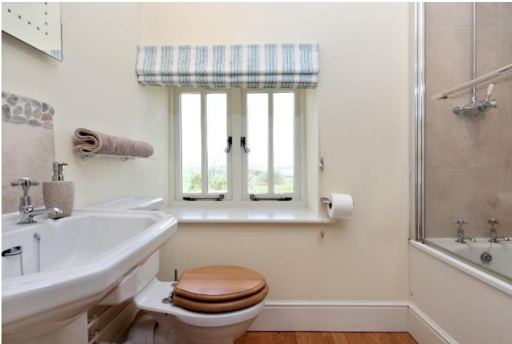
First floor family bathroom