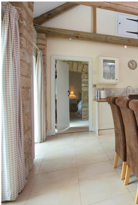
Contrasting wall and door