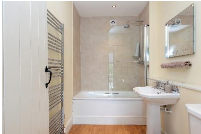
King Bedroom Ensuite