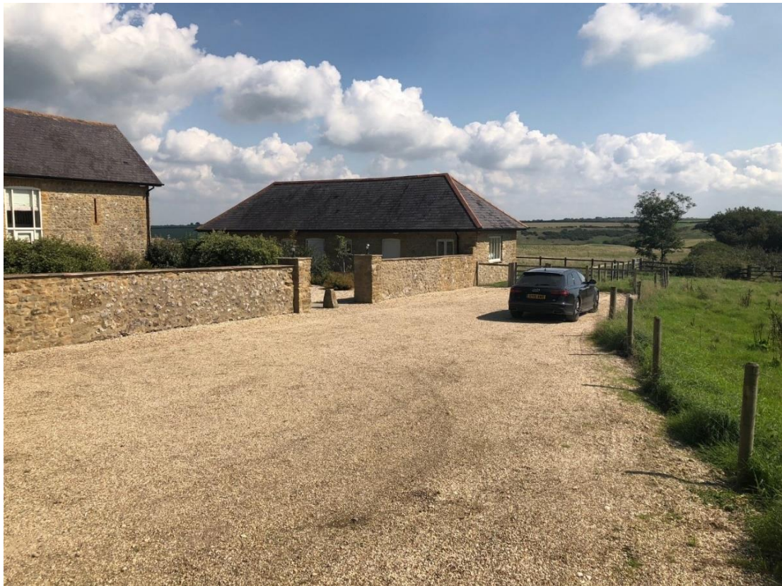
Parking at Wears Farm