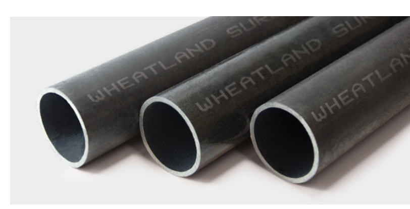
Be sure it's SureThread. Look for the stencil!

The uniformity of SureThread's grain and shape ensures that it moves more easily through the teeth of a die.