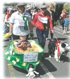
Saturday 6 th August