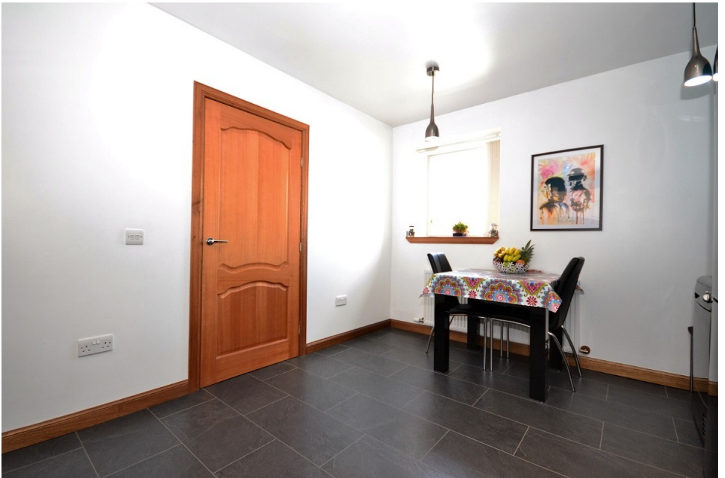
KITCHEN ALTERNATIVE VIEW