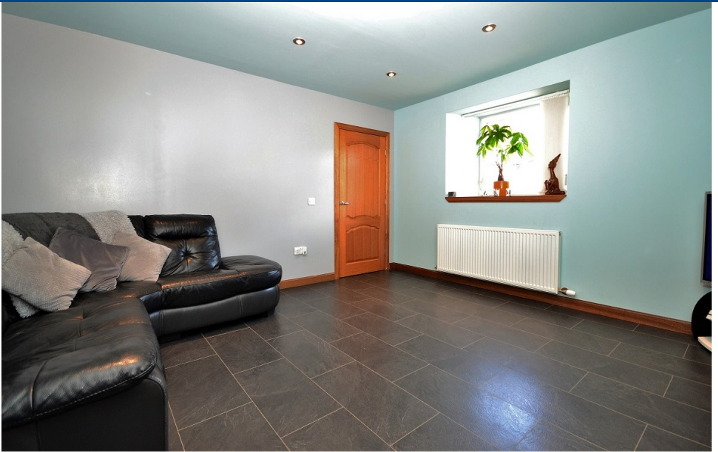
LOUNGE ALTERNATIVE VIEW