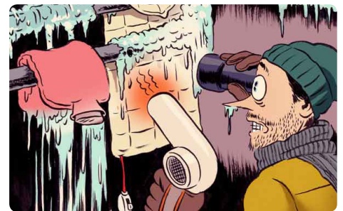
Nobody wants to be this guy!