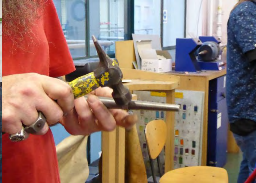
Dauvit demonstrating techniques