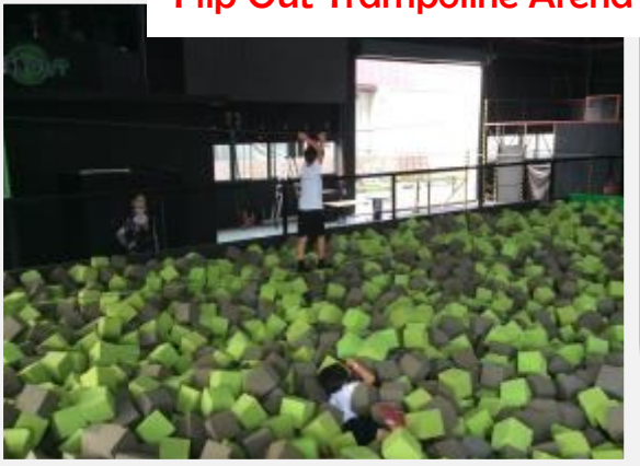
Year 3 Flip Out Trampoline Arena