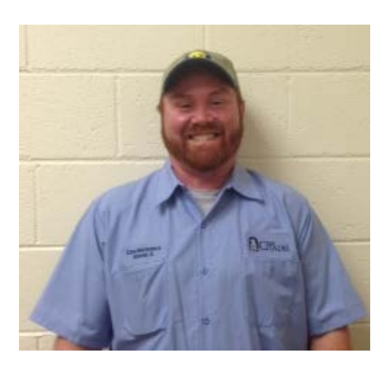
Scott Monnier Bond Hall-Byrd Hall Duckett Hall