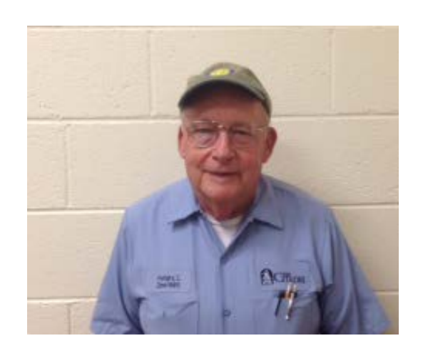
Carl Petters Cadet Services-Coward HallInfirmary-Tennis CenterLaundry