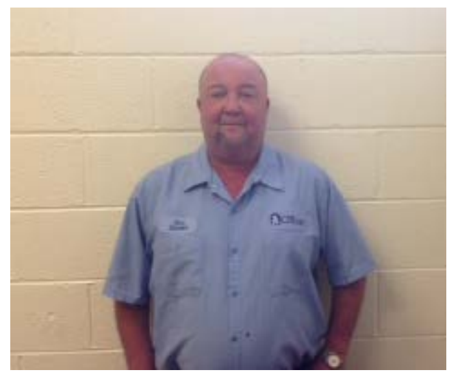
David (Skipper) Ott Law Barracks