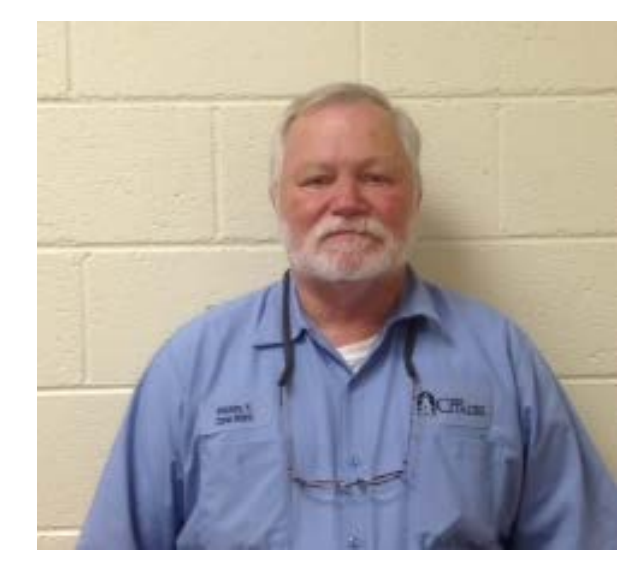
Eddie Mackey Watts Barracks