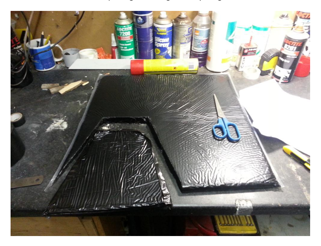
Once this was done, I laid the gel into the foam and it was a perfect fit!

Once I had the foam cut out, I cut the gel to shape with sissors, It takes some cutting as the gel is very sticky on the inside, but holds its shape very well, just used a bit of tape to seal the edges to stop the gel sticking to everything.