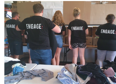
Young people regularly visit the Feed The Hungry Warehouse to help sort and pack clothes for sending overseas.

We are so thankful for those who stand in the gap on behalf of the children we reach through regular financial giving. Your generosity is valued and makes an incredible difference.