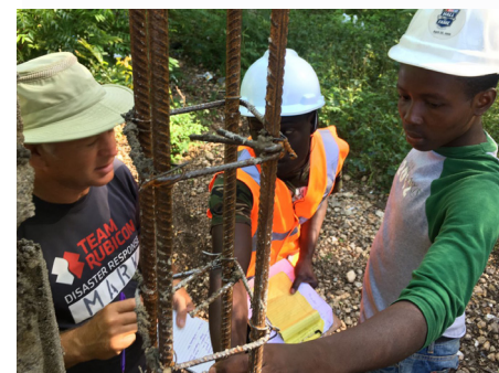
Team Rubicon UK works with local builders to put in place the structures for the new kitchens.