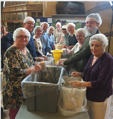
Volunteers pack food at St. David's Church, Exeter, accompanied by Kathrine Jenkins for BBC's Songs of Praise.

We were delighted to be asked to feature on BBC Songs of Praise, which was broadcast on 23rd September. We held a food packing event in Exeter, met Katherine Jenkins and shared about our work. It was an amazing privilege.