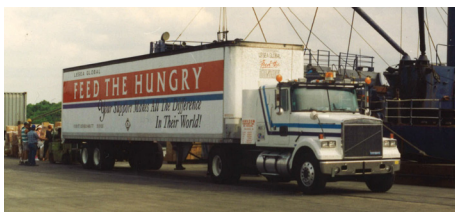
Feed The Hungry's first truck at a shipping dock.