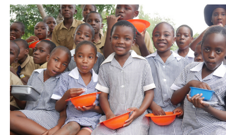
Children enjoy a lunchtime meal provided through ECED.

2015 saw the UK office starting to ship containers of resources to Church partners around the world, and in 2016, we began shipping food containers, formally taking responsibility for supporting Zimbabwe and Kenya. We also had our first trip to Zambia to start developing sustainable farming projects. By 2017, around 171,000 children were being fed through ECED.