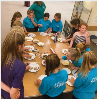
A Girls Brigade group in Hinckley have raised a fantastic £470 to help the Soweto Academy in Kiberia.

Over the last couple of months we have had several supporters set up fundraisers for us using Facebook. If you are one of them, then thank you! We really appreciate it. If you would like more information on how you could do this for us, please go to feedthehungry.org.uk/ff