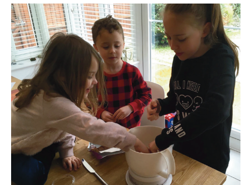
Some young people baking cakes for Feed The Hungry.

Do you have a story you can write and share; a page to pen in the lives of the children we work with? Is there a chapter you can write in your local church, work or community context?