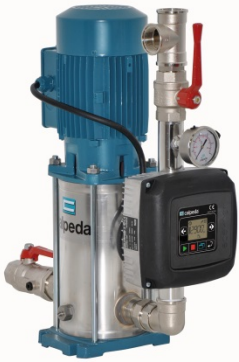
Single pump booster set with vertical multistage and inverter drive

If you have a building of more than two storeys or have a reduced / fluctuating mains water pressure you may need a booster set. If you have a private water supply (borehole) that discharges water into a reservoir or header tank for onward transport you may need a booster set.