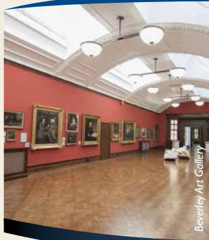
Beverley Art Gallery