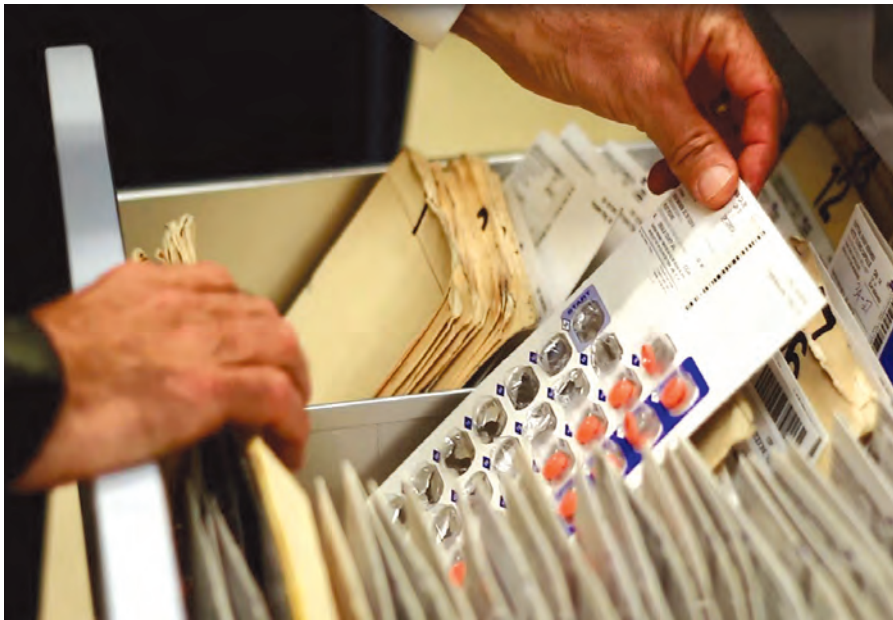
Centurion commends utilization of Electronic Ordering and Medication Administration Records to alleviate problems that may occur due to staffing issues and manual paper systems.

communicate them to the prescriber. Bar code scanning is then used to verify that the correct medication, dose and directions are dispensed and delivered to the correct facility and patient. The pharmacy further reduces medication errors by working with clients at the facility level individually to streamline both the sending of medication orders and reception of prescriptions.