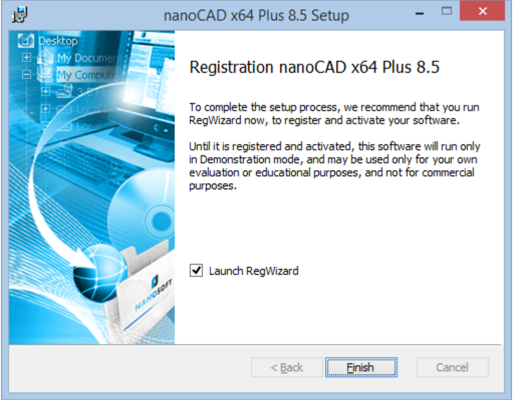
Click Finish to finish installation.

It is also possible get a nanoCAD license later. To do so run Registration Wizard from the nanoCAD folder of Windows Startup menu.