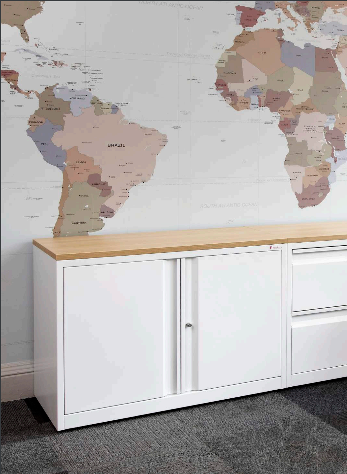
8 Freestor hinged door and side filer Internal component: plain shelf