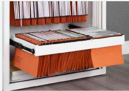
Pull-Out Filing Frame This filing frame holds 2 rows of front to back suspended filing and pulls out of the unit for ease of use.