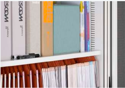
Lateral Plain Shelf with Fixed Rail This shelf stores items like a traditional plain shelf, but can also store suspension files on the rail under the shelf, providing greater flexibility.