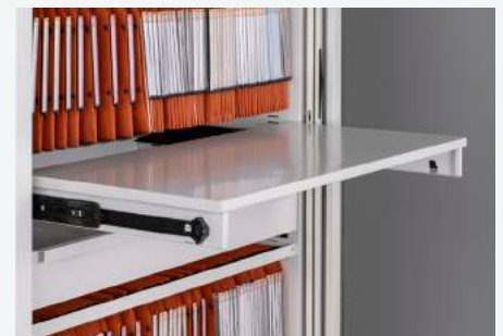
Pull-Out Shelf A pull-out shelf to allow staff to reference and quickly edit files whilst at the unit.