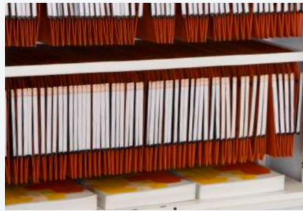
Lateral Suspended Filing Rails For fixed side-to-side suspension files.