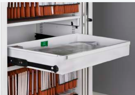
System Drawers Pull-out drawers with optional dividers for storing general stationery items, IT equipment, chargers and cables.