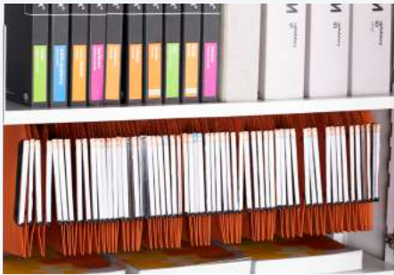
Lateral Plain Shelf with Fixed Rail This shelf stores items like a traditional plain shelf, but can also store suspension files on the rail under the shelf, providing greater flexibility.