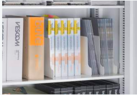
Slotted Shelf For use with dividers, a slotted shelf is useful for items that lack rigidity such as magazines, shelf files and wallets.