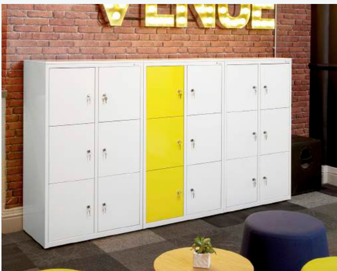
Top Image: Combination Lock Bottom Image: 6 Door Locker with Cam Lock