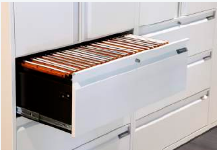
Side-to-Side Filing Suitable for drawers only, allows for suspending files side-to-side.