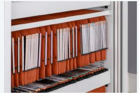
Lateral Suspended Filing Rails For fixed side-to-side suspension files.