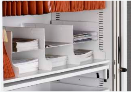
Slotted Shelf For use with dividers, a slotted shelf is useful for items that lack rigidity such as magazines, shelf files and wallets.