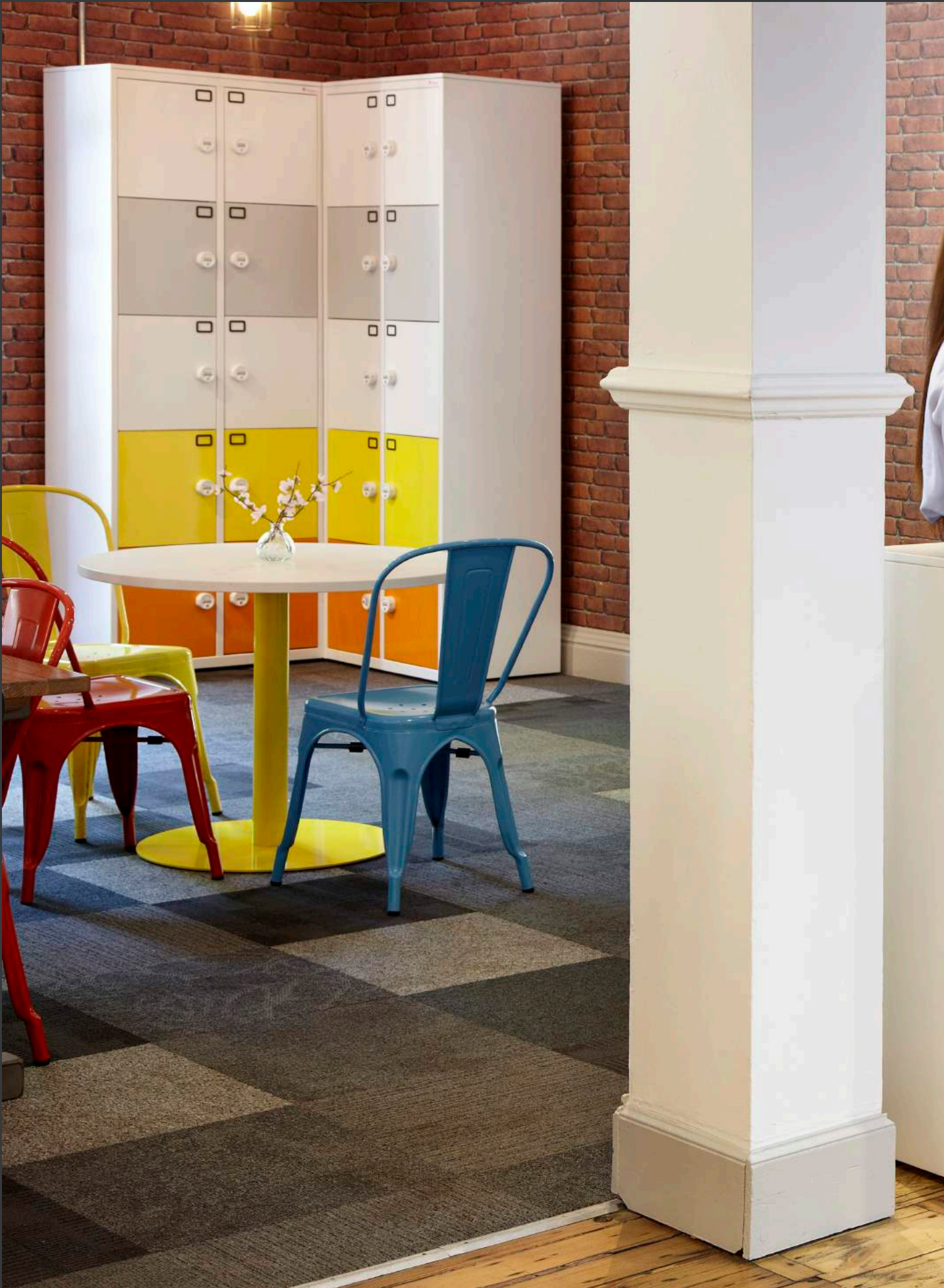
18 Freestor 10 door Accent lockers with combination locks Freestor hinged door storage with 6 door Accent locker and planter