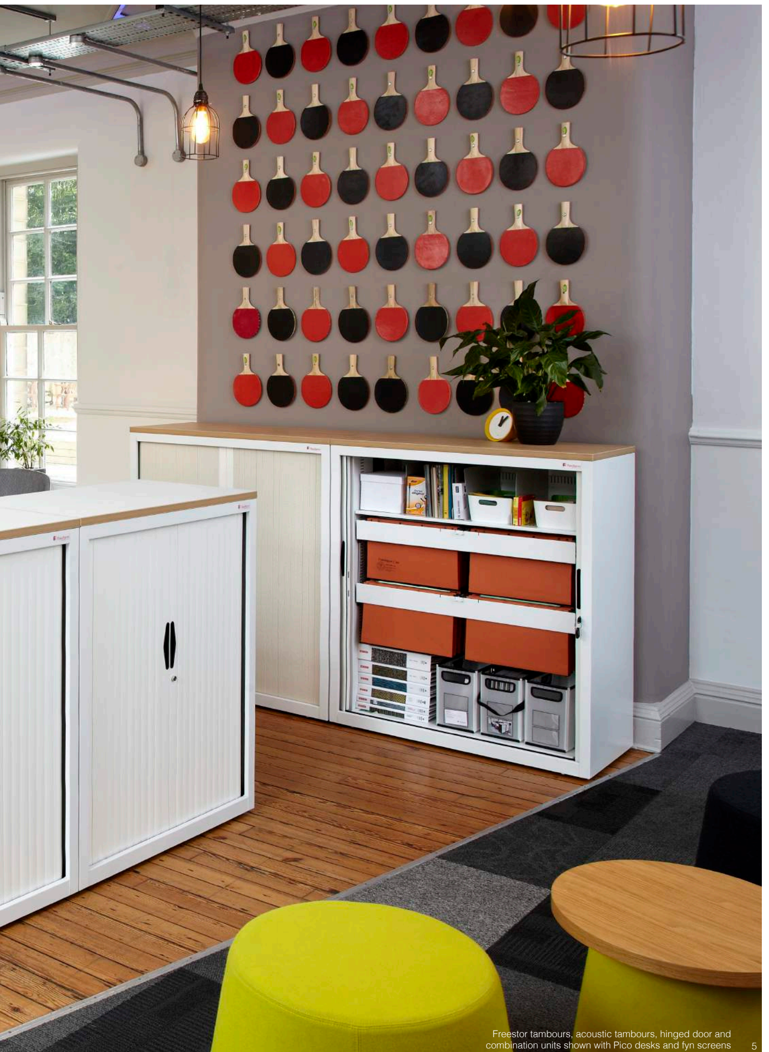
Freestor tambours, acoustic tambours, hinged door and combination units shown with Pico desks and fyn screens