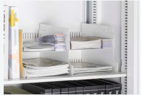
Pigeon Hole Shelf Suitable for traditional pigeon holes for internal mail or storing A4 and A5 forms or literature.