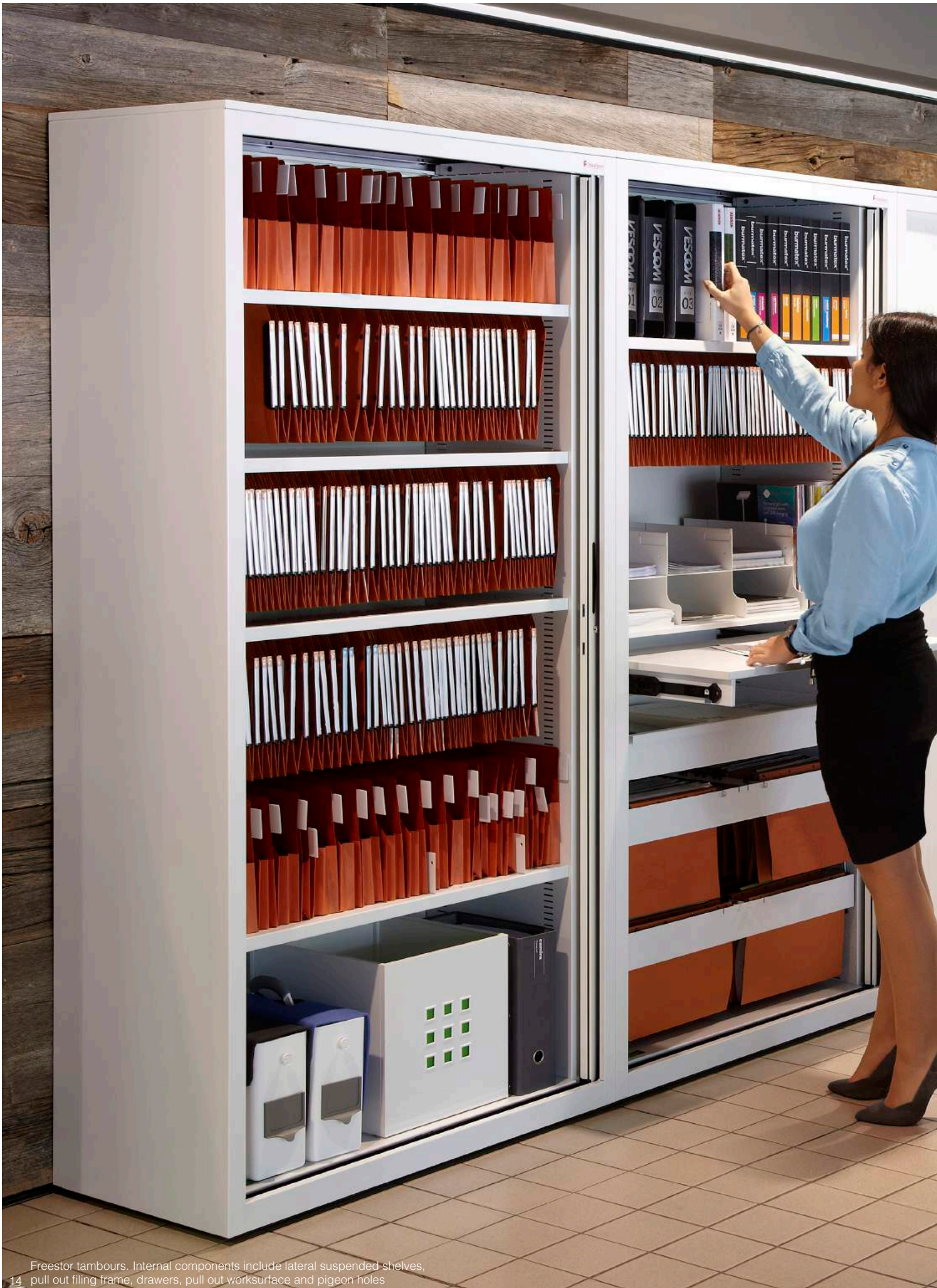
Freestor tambours. Internal components include lateral suspended shelves, pull out filing frame, drawers, pull out worksurface and pigeon holes