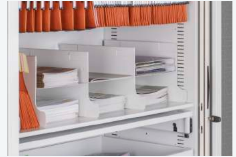
Pigeon Hole Shelf Suitable for traditional pigeon holes for internal mail or storing A4 and A5 forms or literature.