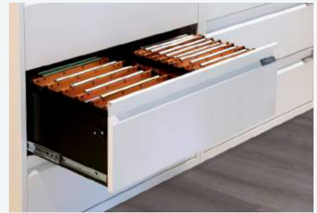
Front-to-Back Filing Suitable for drawers only, allows for suspending files front-to-back in 2 rows.