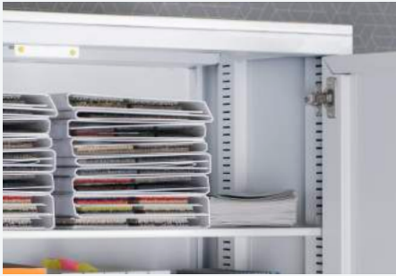
Plain Shelf Ideal for storing Lever Arch Files, boxes and miscellaneous items.