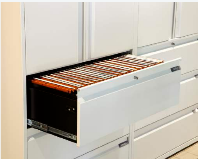
Top Image: Freestor combination units and hinged door. Bottom Image: Side-to-side filing.