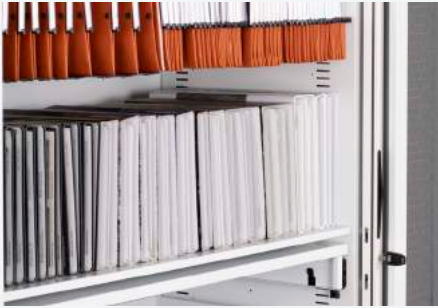
Plain Shelf Ideal for storing Lever Arch Files, boxes and miscellaneous items.