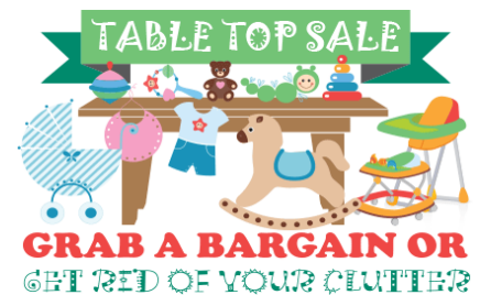
Table top sale – Maybe you could host a Christmas fair or table top stalls event at your church and charge all stall holders £5-10 for their table which would be given to Bridgebuilder Trust. This would make for a fun event for the whole church family and a great charity fundraiser.

Quiz night – Could you host a quiz night and get people to sign up teams to take part, charge either per person (£5-10) or per team of 5 (£50). Get a prize for the winners and either make up your questions or compile some from online - don't forget the answers!