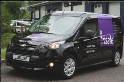
24 Hour Nationwide Service

REMOVAL AND RELOCATION OF YOUR EXISTING SAFE.