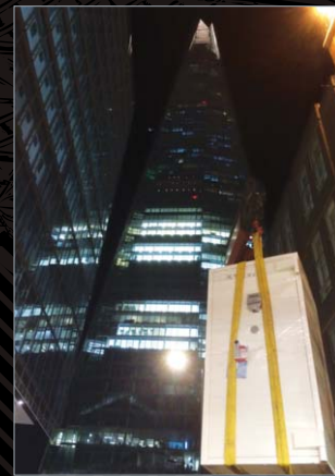
Crane Delivery of Grade V Safe The Shard, London