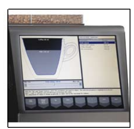
Multimedia touch screen