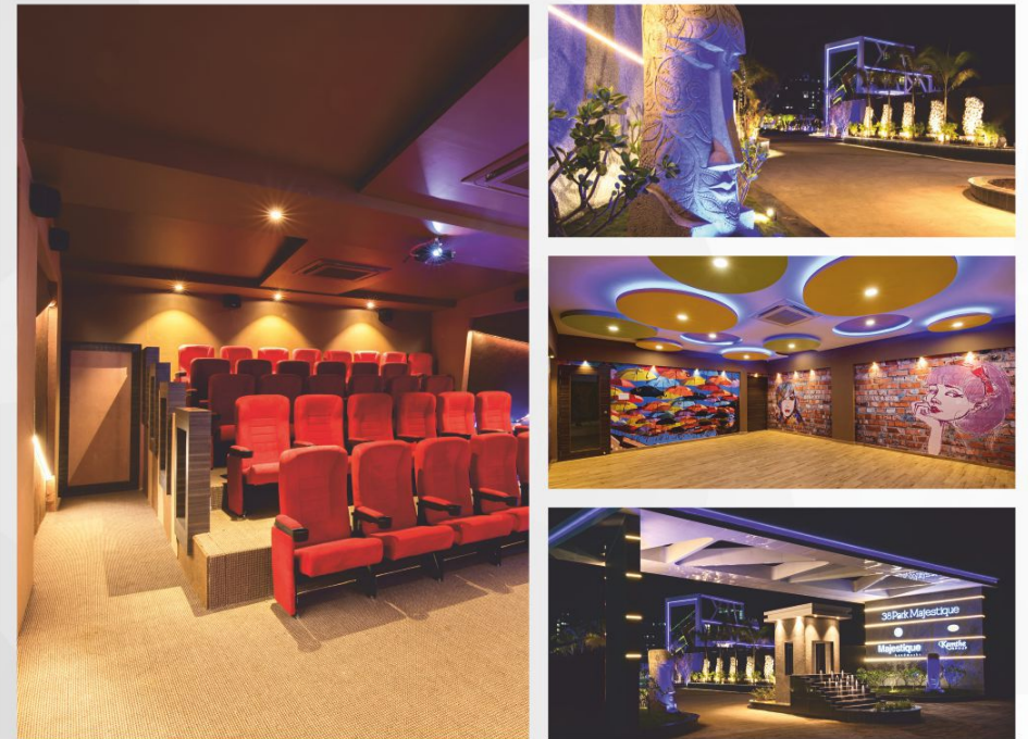
ACTUAL SITE PHOTOGRAPHS