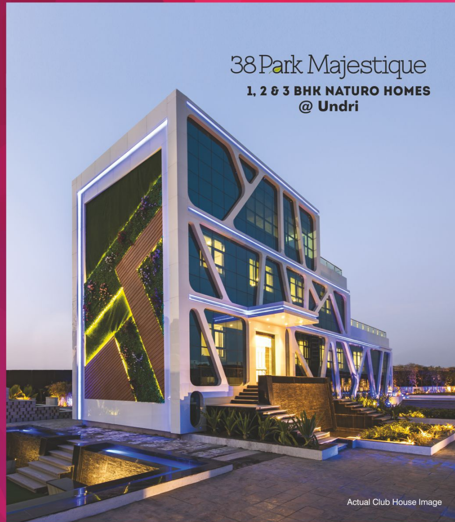
Actual Club House Image

☎ 77200 11999 / 997 www.majestiqueproperties.com