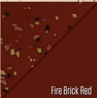
Fire Brick Red