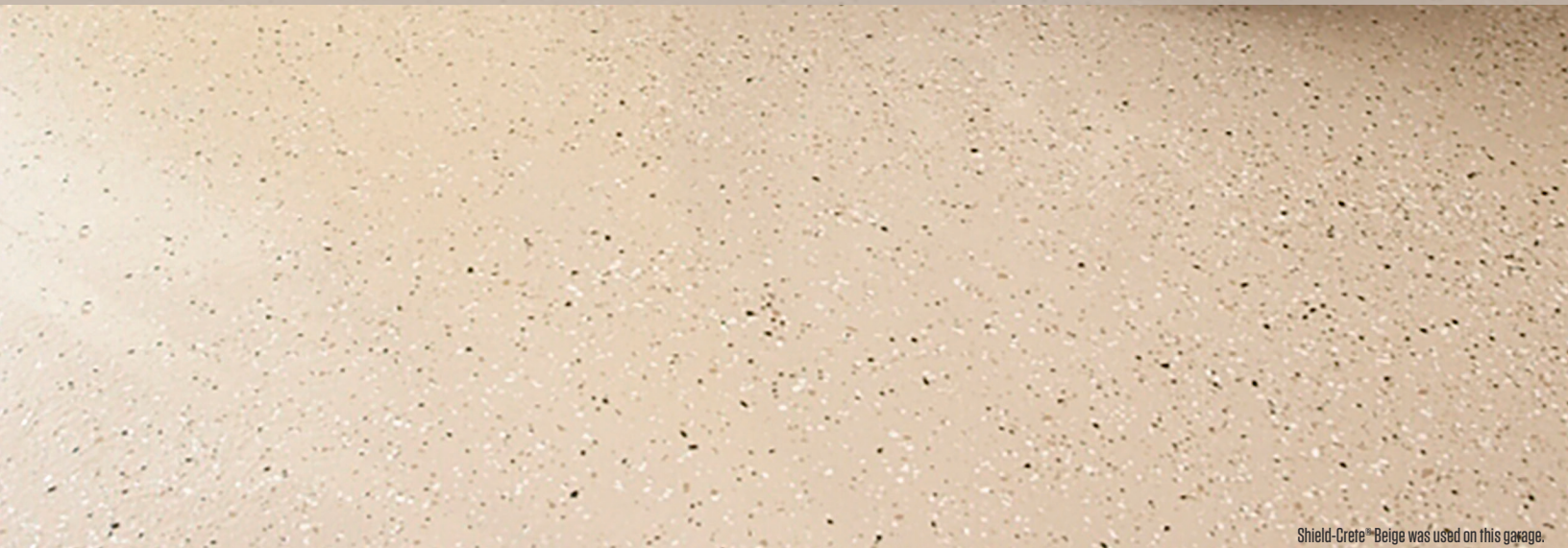
Shield-Crete ® Beige was used on this garage.