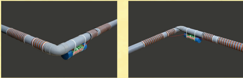
SUPER DESCALER SD-D

Tailor made solutions are available for various types of requirements and typical usage