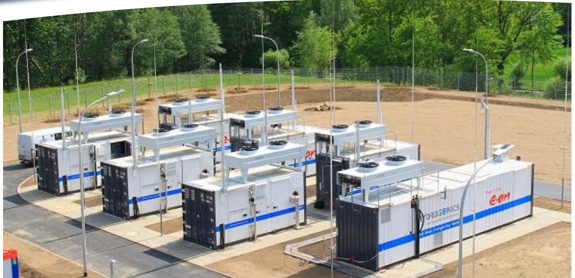
Power-to-Gas plant in Falkenhagen, Germany