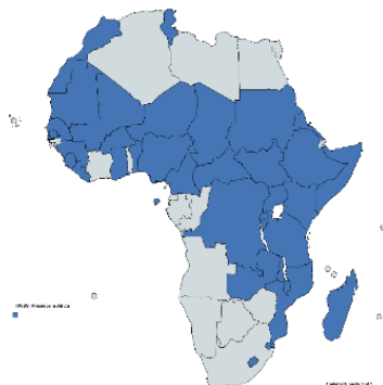
RWSSI Interventions in Africa since 2003

Despite considerable efforts to provide clean water to rural communities by AfDB and other development actors in past decades, about 300 million people in rural Africa still lack access to drinking water. Not only is water central to the new five strategic priority areas of the AfDB ( High 5s ), stakeholders are currently developing the 2016-2025 RWSSI Strategy to enable continuous scaling up of activities while using transformative and innovative delivery approaches.