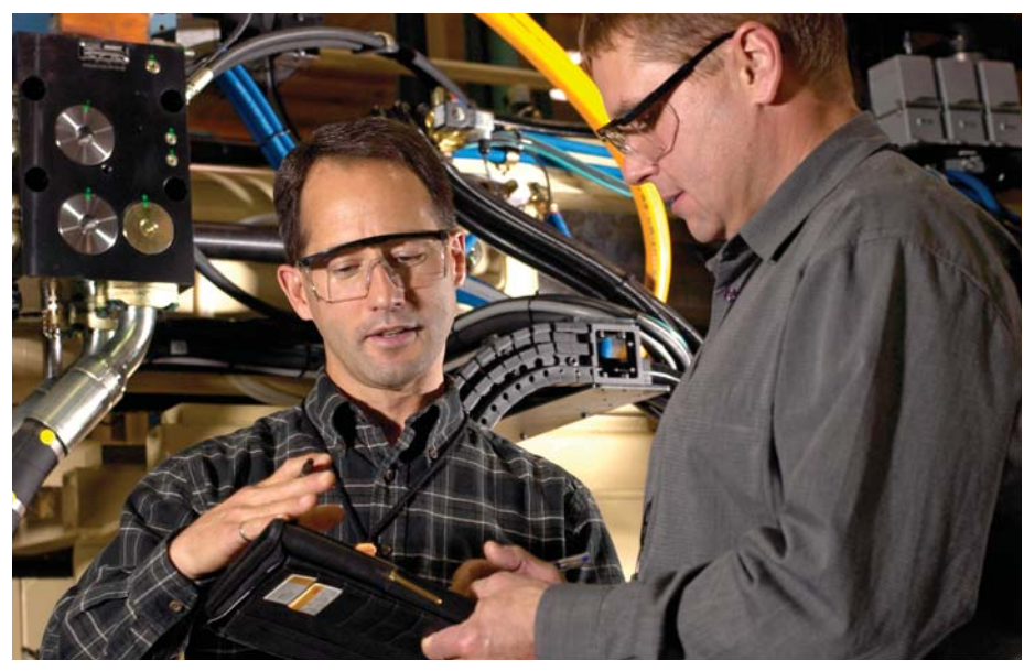
Husky experts work with customers to ensure the highest level of equipment performance.

Husky takes responsibility for supporting our customers from start-up through the lifecycle of the system. Husky offers the experience and resources to keep our systems running at peak efficiency and is the only supplier in this output range to provide a full suite of services and support.