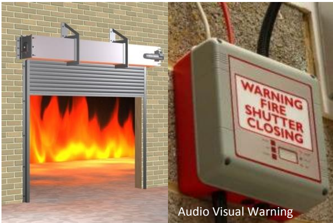
Audio Visual Warning

Our in-house fabrication facility is also capable of handling all Industrial Door and Roller Shutter repairs and upgrades from any manufacturer.