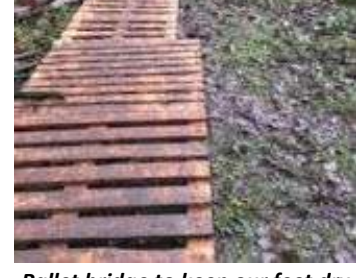
Pallet bridge to keep our feet dry

We have all seen the floods across the country and Llangattock didn't miss the rain at the end of October with the Usk flooding again and causing chaos. The Alder Carr is special because of the water which runs through the site but sometimes it comes up in unexpected places. There is a spring which flows underground across the meadow and most of the year will emerge somewhere in the woodland. After heavy rain it rises much sooner flooding the main pathway from our work area to the hub of the woodlands. Last week we decided there was only one thing for it, a 'pallet bridge'! The long term aim will be to provide a French Drain system which has helped elsewhere on the site but it needs a mini digger and much more thought before we can do that In the meantime the pall