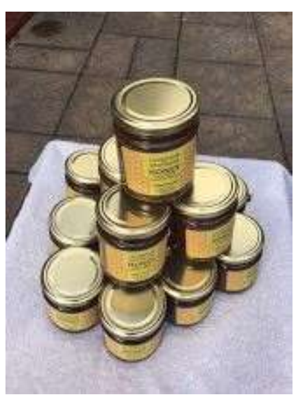
Our very own honey.

This month we have been meeting with new or prospective beekeepers in the Llangattock school room on Wednesday evenings, learning about the beekeeping year and other subjects relating to the skills required for honeybee husbandry. Although many more expressed an interest in joining, the weather and other previously booked engagements have meant that all those who booked a place have been