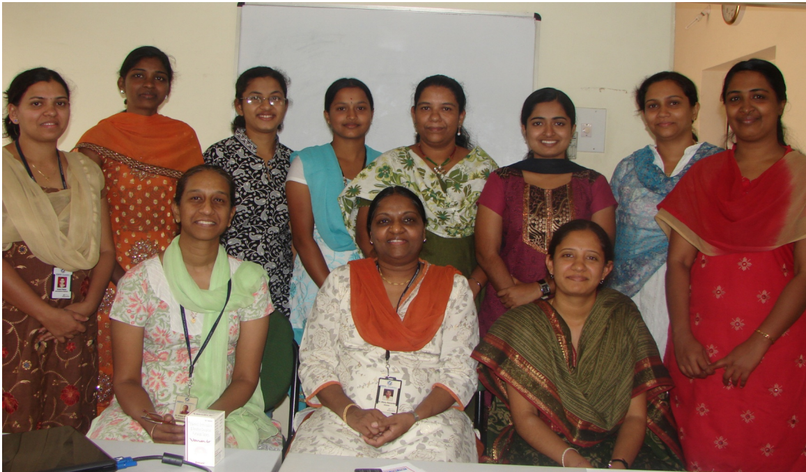
Batch of counselors trained in March 2011 along with the trainers

1. The updated WHO Recommendations of 2010 were made into new protocols and printed and were distributed to all the partner hospitals. were also taken in the same year.