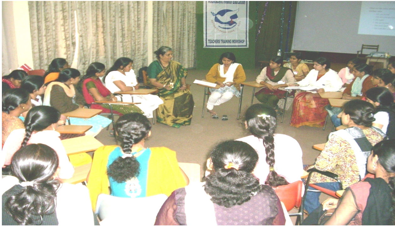
Peer time in two circles - for 33 participants . 4th Pune Teachers Training Workshop.