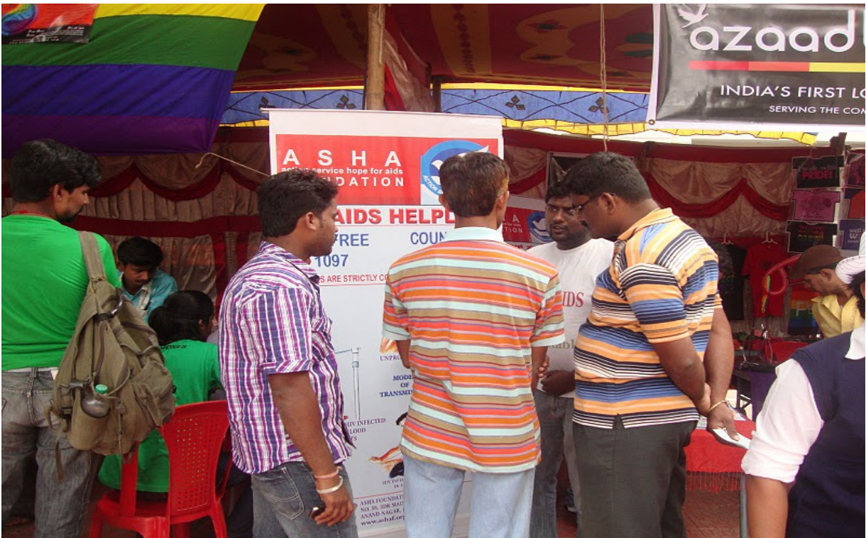
Awareness program at Bangalore habba -21.11.2010