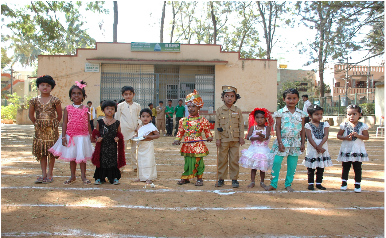
Fancy dress competition on sports day 26.1.2011