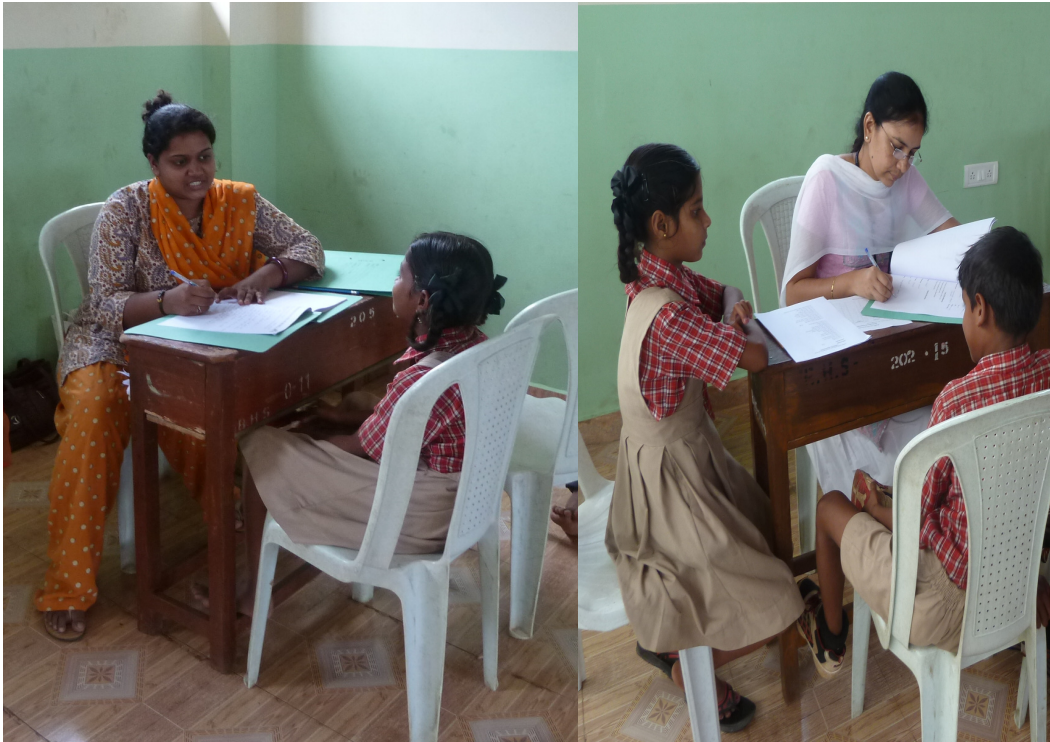
ICMR project staff examining children

All the entries and results so obtained have been entered into the data base that was created for this study.