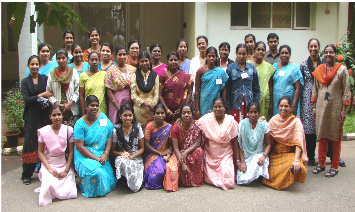
Update workshop for nurse counselors-1-3 Dec.2010.