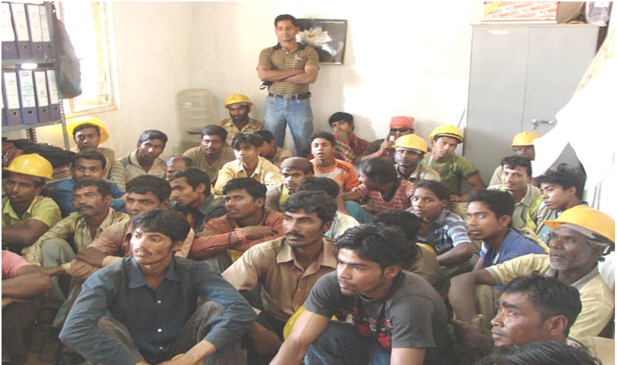
Awareness program - metro construction workers at Ulsoor-May 2010