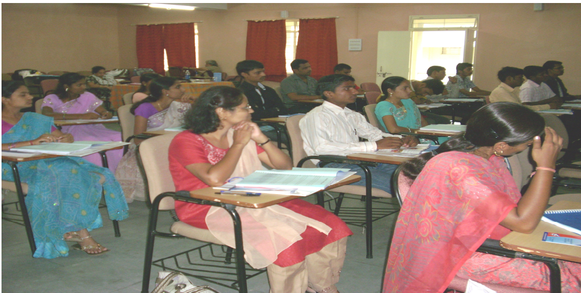
3 rd Pune Alumni Meeting : A view of the participants