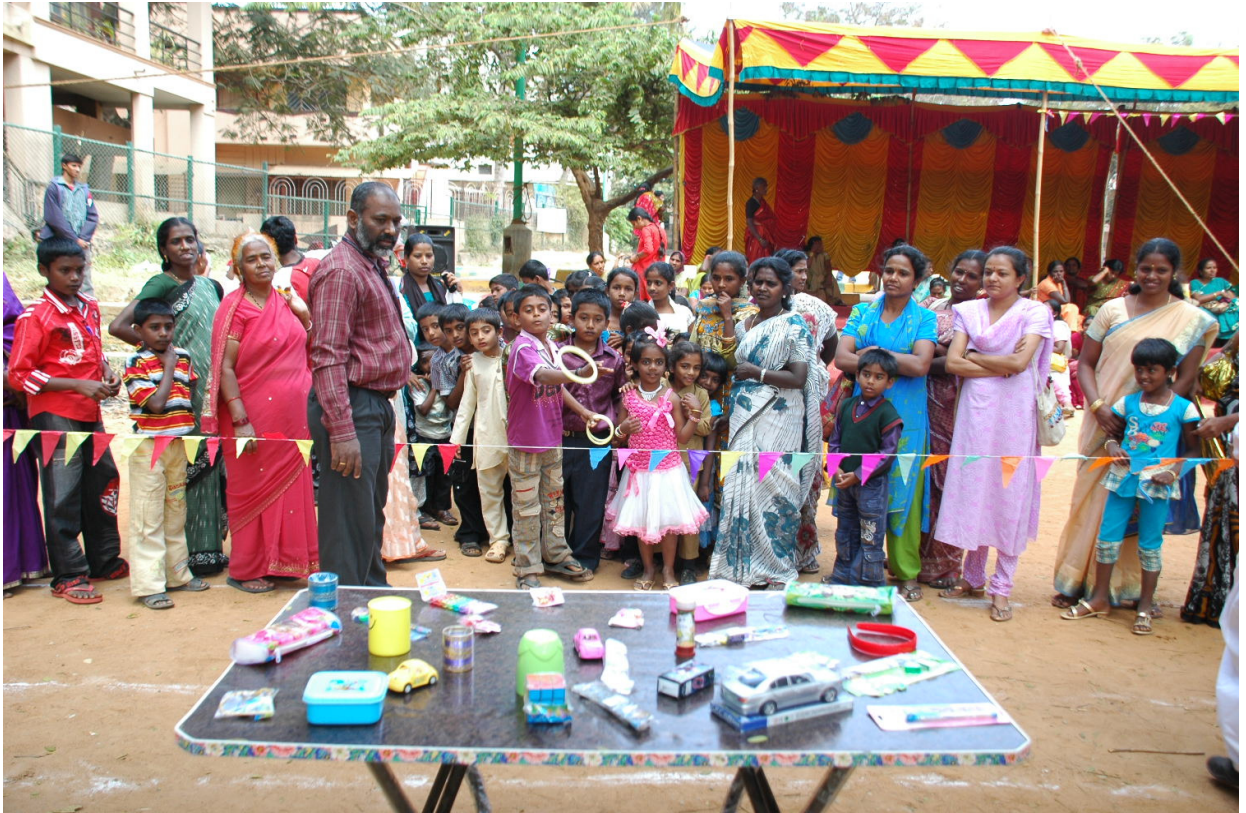
Ringing the item –on Sports day-26.1.2011