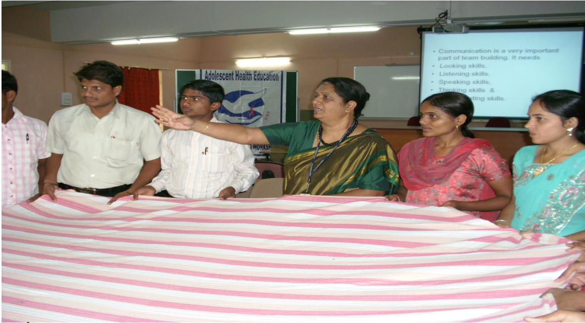
3 rd Pune Alumni Meeting : Ice breaker in progress

Alumni Meeting- One Alumni meeting was held on the 17 th of Dec 2010 at Pune. 5 schools were represented and 16 participants attended the meeting. It was a one day program that was meant to introduce the new curriculum to the teachers. An enthusiastic response was seen. Each of the alumni participants wanted to do his bit in encouraging other teachers in Pune who had done the AHE program.