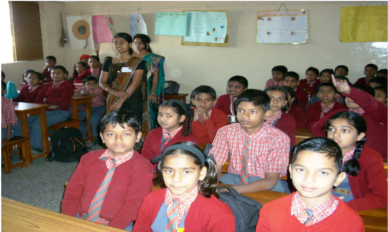
Practicum at Nirmala Convent School

Title for the new manual- A competition was conducted for three schools where the new curriculum was being field tested. The competition was to suggest a title for the program and its resource. The winning title came as a result of combining words suggested by three students of Baldwin Girls' High School. The title is Anmol Ashayein .