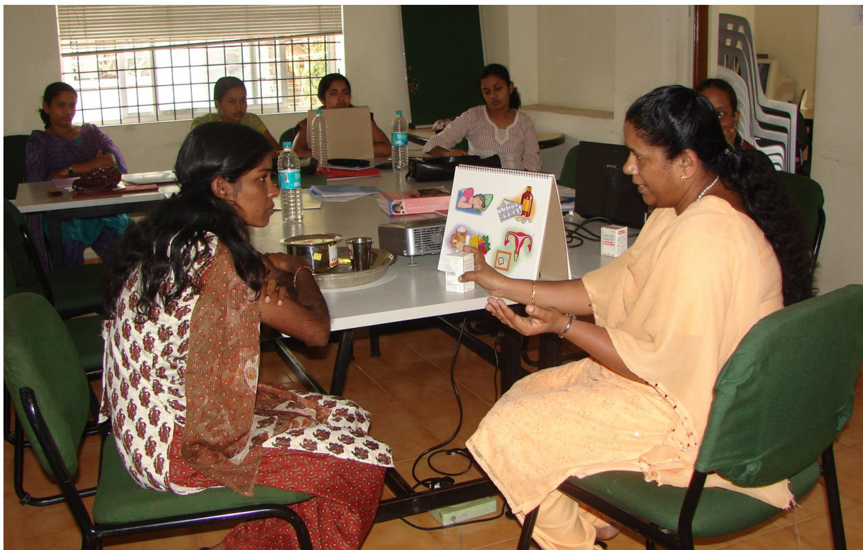
Practising role- play at the counsellors workshop-March 2011