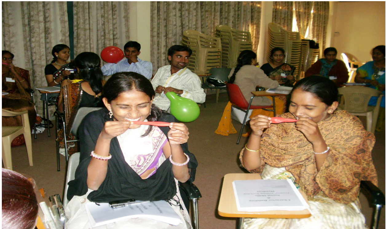
Teaching implementation methods through balloon activity

Follow up- The outstanding feature of the follow up in Pune continues to be that all the schools that attended the workshops have implemented the program. About 2,600 new students joined the program. The parent and student manual was provided to all these new students. Follow up in Karnataka, Shimla, & Vishakapatnam took place as and when time permitted through correspondence and telephone calls. Project Life volunteers in Bangalore are following up the 40 Catholic Schools in Bangalore. They are reaching out to 10,000 students in these schools. It was heartening to note that some of the institutions have continued to do the program since the teachers first attended the Teachers' Training Workshop