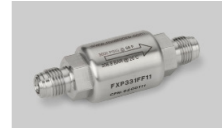
Shattering the industry standard for ultra-high purity gas filtration