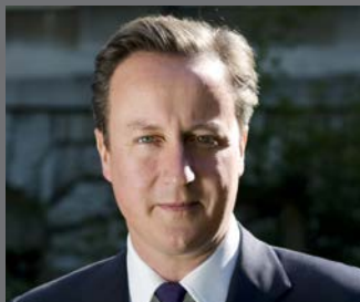
The Rt. Hon. David Cameron MP, Prime Minister.

“To mark 800 years since Magna Carta, I am pleased that London will welcome global leaders in both business and the law to discuss the issues that are shaping the agenda legally, commercially and socially over the next generation. I am delighted to support the Global Law Summit – it is yet more evidence that Britain continues to lead the way in promoting free enterprise, economic growth, and the rule of law around the world.”