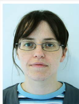
✓ correct photo