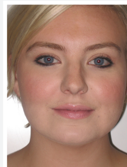
X too close