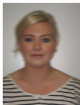
X picture blurred