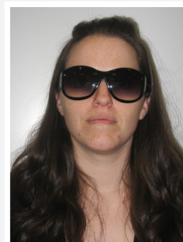
X no sunglasses