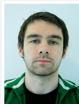
✓ correct photo