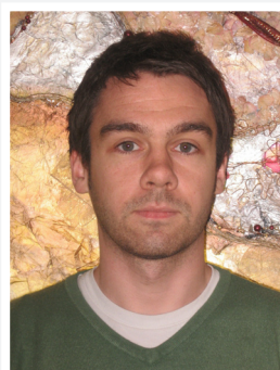
X background too busy

Please note that photographs become part of our official records and we will not return them.