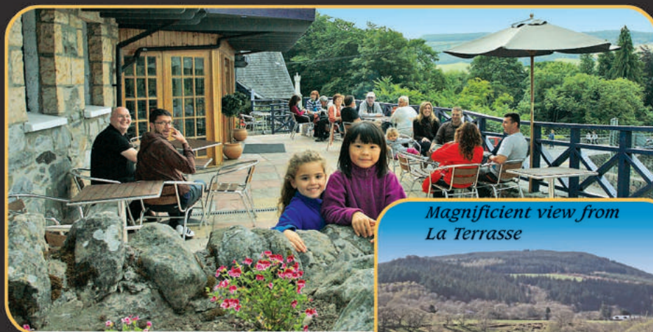
Magnificent view from La Terrasse

A very wide assortment of home-baked produce is served daily in our Gallery Coffee Shop. Sit inside, or outside on La Terrasse, and enjoy great views of Drumnadrochit itself and its very attractive surrounding countryside.