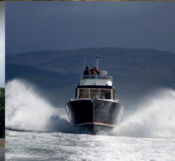
Why not stay awhile in Barcaldine Castle? Bag a MacNab, or zip across the sea to St Kilda.