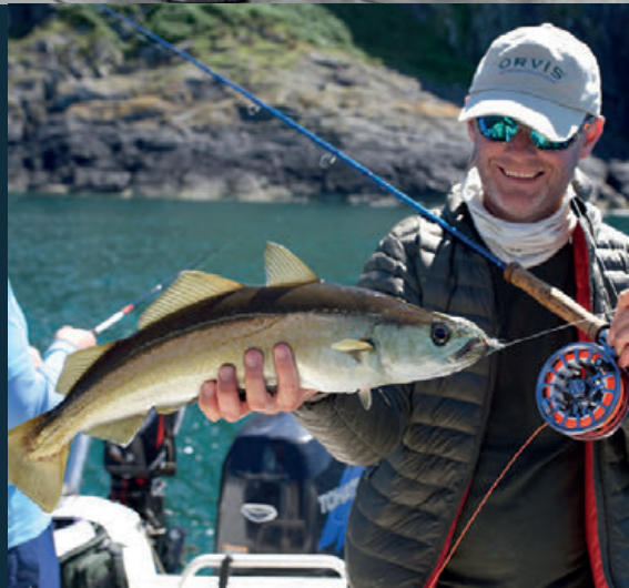
Top clockwise: A group of beginners learning the tricks of the trade, sea fishing for Pollack, family group on the Tay.