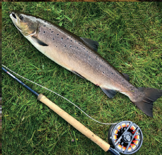
Top left clockwise: River Gruinard, River Ordy, Stag in Durness, Salmon from River Cree, Casting on the River Gruinard.