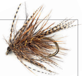
All flies

A GREAT ALL-ROUNDER, WHICH OVER THE LAST FOUR SEASONS OR SO HAS EARNED A REGULAR PLACE IN MY FLY BOX.