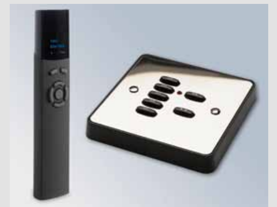
Remote controls Silent Gliss 0450

Our Customer Services team will be on hand from the start to offer expert advice on the most appropriate systems, control combinations and wiring for your project.