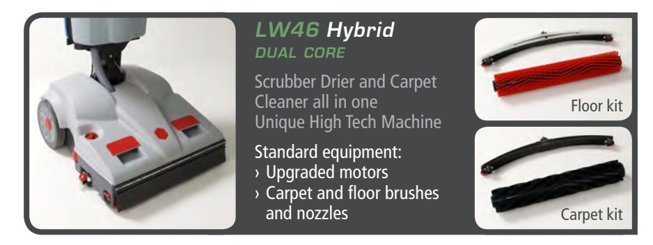
LW46 Hybrid Fast and excellent scrub and dry!