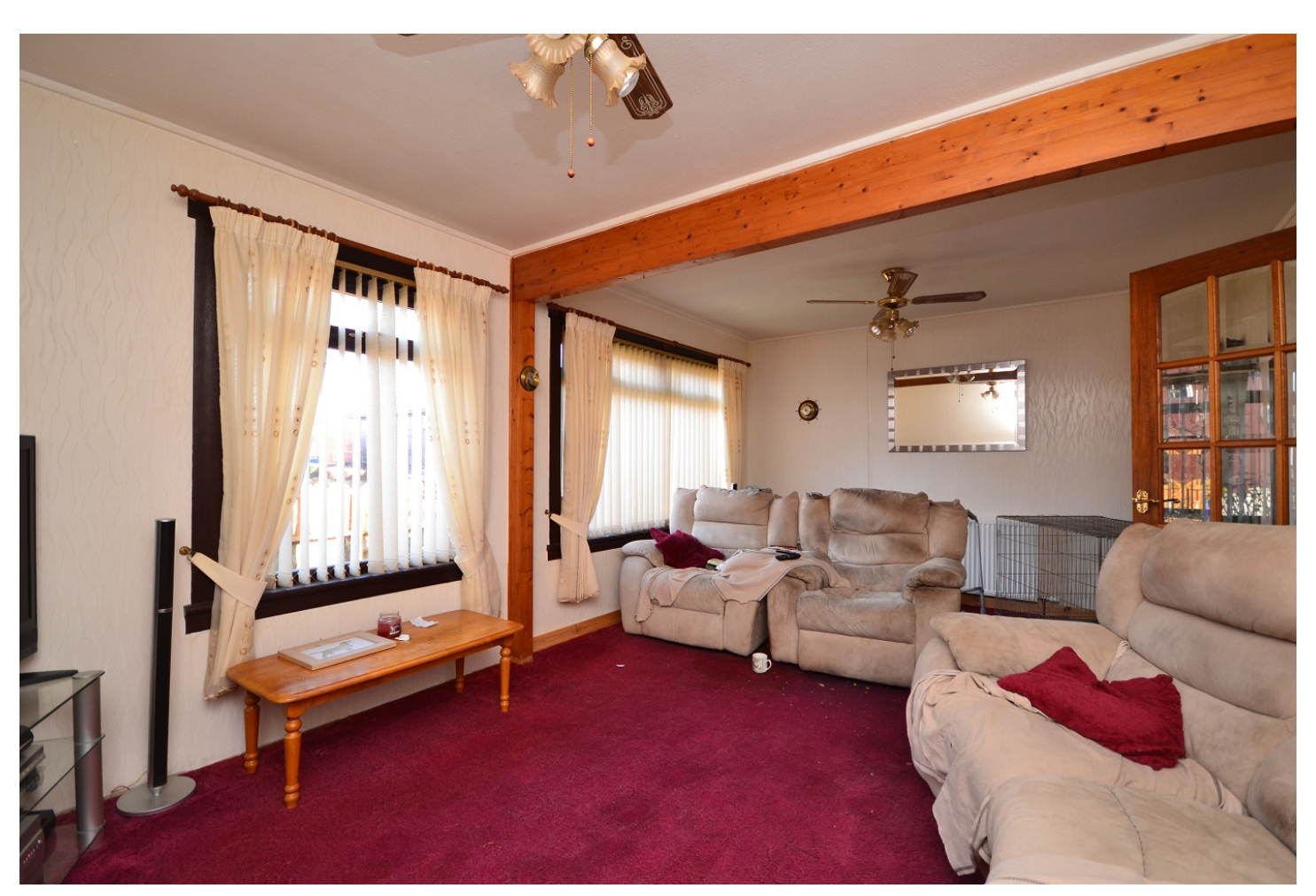
LIVING ROOM ALTERNATIVE VIEW