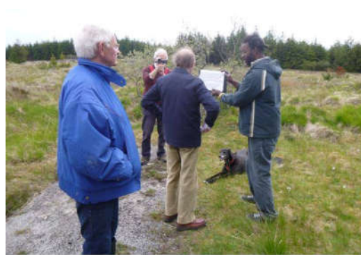
Clachan Old Pals out & about

We are looking to start an Old Pals group in Southend shortly.