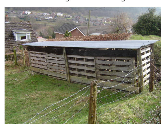
One KTAT Trustee's low-cost wood drying shed made from (mostly) recycled materials.

4.75 inches. This will help the logs to season evenly and quickly but also mean that the logs will burn better. See http://www.lightfoot.org.uk/page/Wood_Stores/ for more info on designs or where to get them.