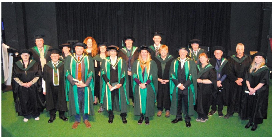
Graded members and Guests at the Encaenia