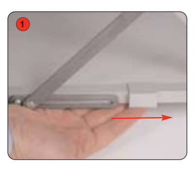
Slide locking tab away from pivot arm at base of unit. Repeat for 2nd locking tab.