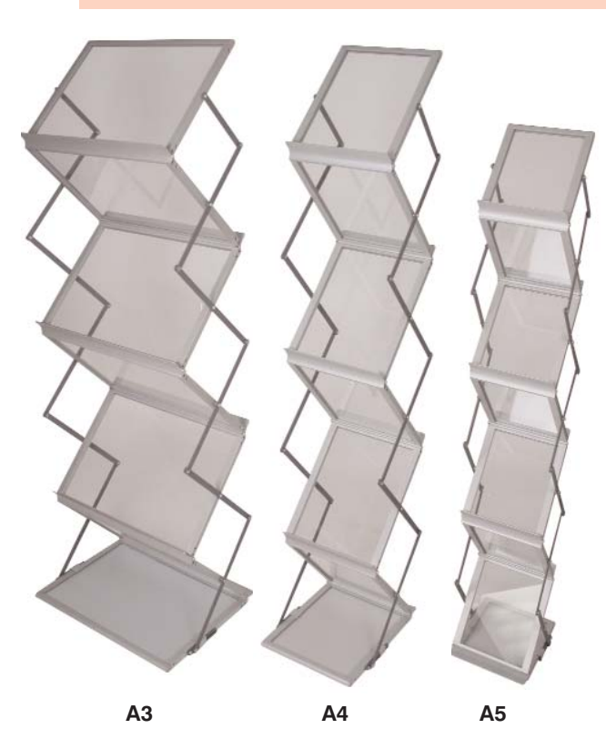
NB A4 and A3 versions have 6 pockets, A5 version has 7 pockets