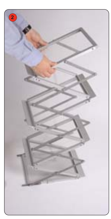
Holding the top tray, gently raise the trays upwards. Place your foot on the base to aid stability.