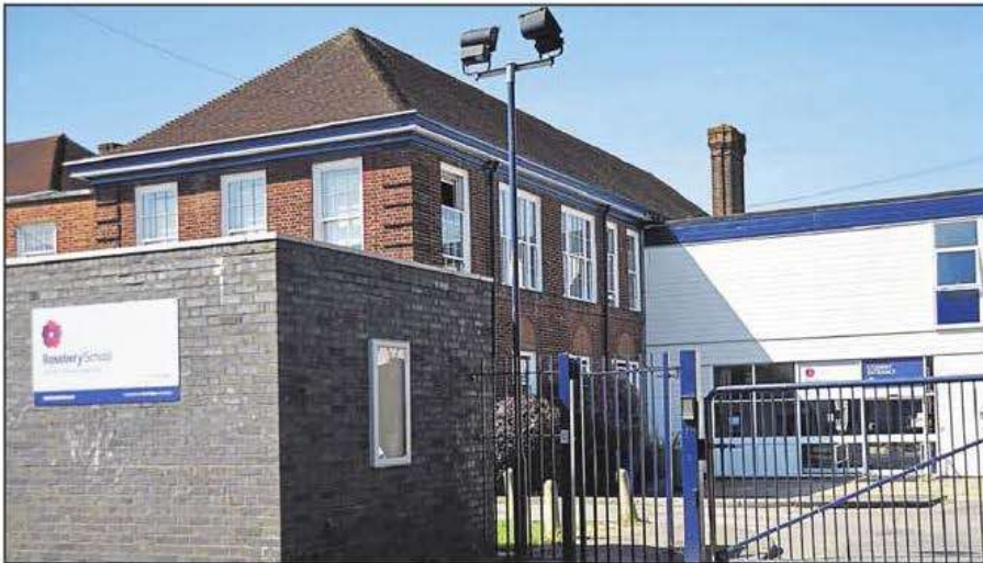
Rosebery School was recently visited by Ofsted inspectors