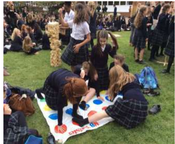
Rosebery Day 1973