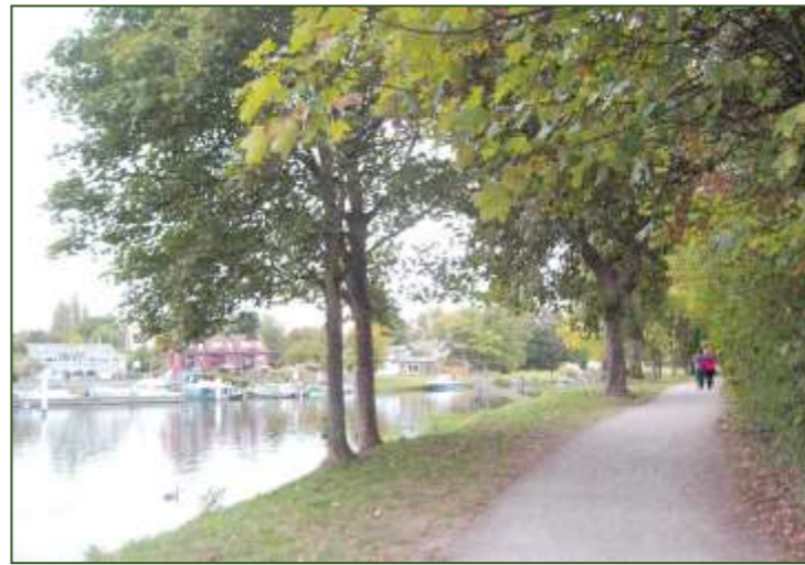
Autumn 2009: Weybridge riverside, before the moorings work

Do you recall how attractive our local stretch of Thames riverside was, up until autumn 2009 (see our top picture)? It was a well-tended riverbank where people could sit on the grass in the sunshine or in the shade of a tree, and enjoy fine views and tranquility.