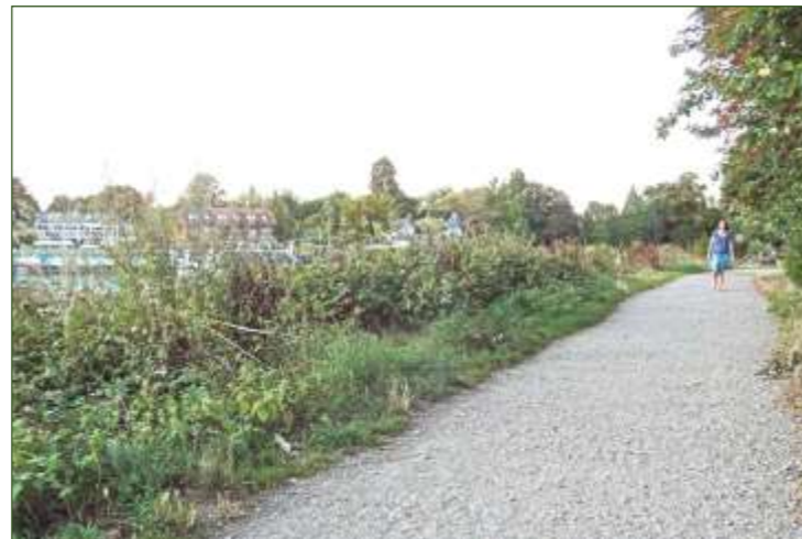
Autumn 2016: The same riverside, looking sadly neglected

Then the Environment Agency cut down the trees and fenced off the riverbank, between Weybridge Ladies ARC and the foot ferry, as part of works to install concrete moorings. They left the temporary fence in place for five years, despite local protests, with the riverbank becoming an unsightly bramble patch.