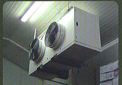
3 MONTHS AFTER ENERSHIELD IS FITTED