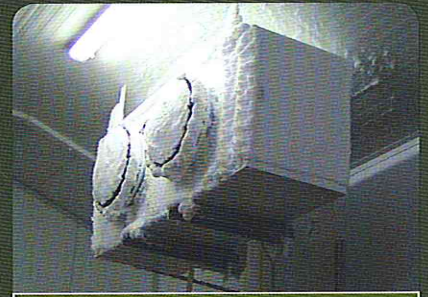
BEFORE ENERSHIELD IS FITTED