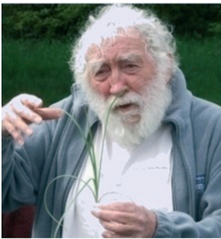
David Bellamy in Botanising Field Workshop