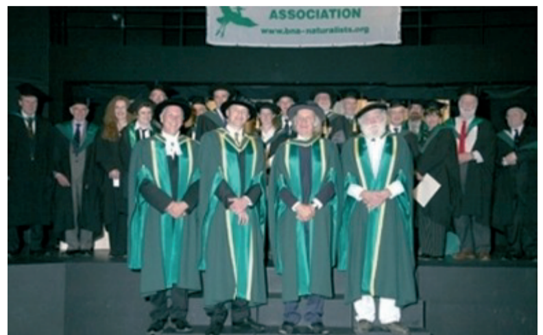
Fellows and Registered Members