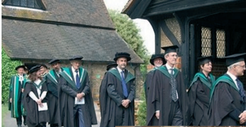
The Encaenia procession