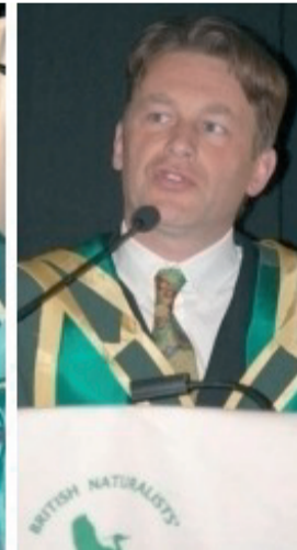
Chris Packham receiving an Hon. Fellowship and signing book of Fellows Honoris Causa