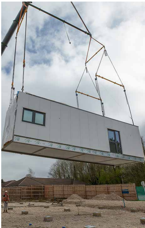
Images captured during factory assembly and module installation.