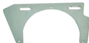
7 KG BALLASTS