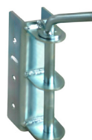
DROP PIN Ø16 MM