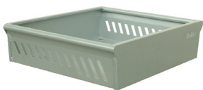
BASKET 650X550XH170 MM