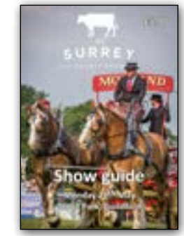
2000 Show Guides sold

W 30,000 visitors, rising annually to 62,000 on the run up to the Show